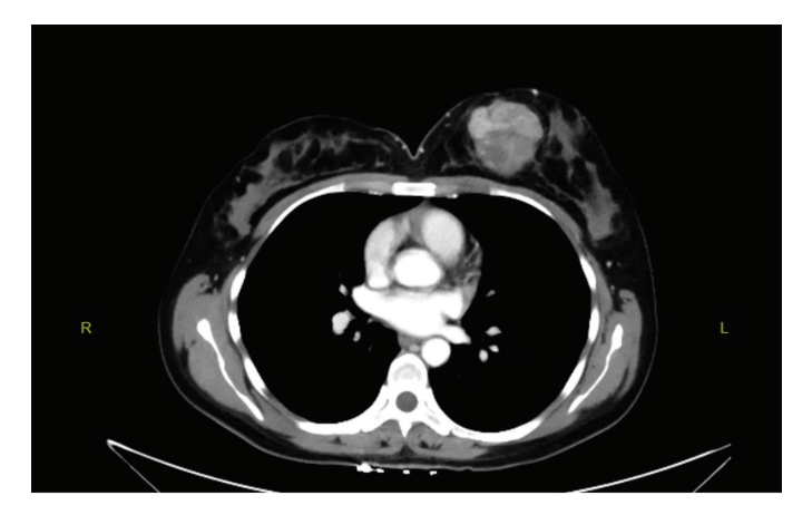
Figure 4: A giant fibroadenoma image on thorax tomography taken due to respiratory distress