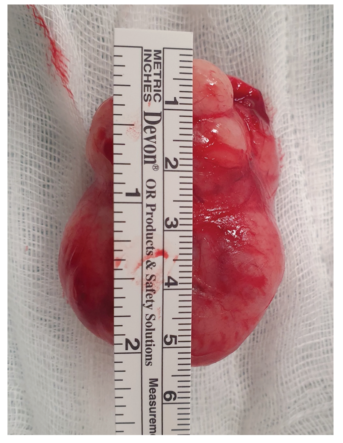
Figure 2: Measurement of the size of a giant fibroadenoma