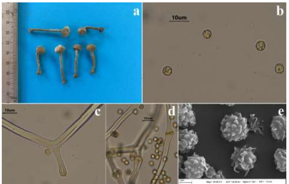
Figure 1. Tulostoma simulans : a. basidiomata, b. spores (LM), c-d. capillitium (LM), e. spores (SEM). Şekil 1. Tulostoma simulans: a. bazidiyomata, b. sporlar (LM), c-d. kapilisyum (LM), e. sporlar (SEM).

Tulostoma species were retrieved from NCBI GenBank database and used as in-group sequences in the phylogenetic analysis. As the out-group sequence, nuclear ITS rDNA sequences of Coprinus comatus (O.F. Müll.) Pers. was selected.