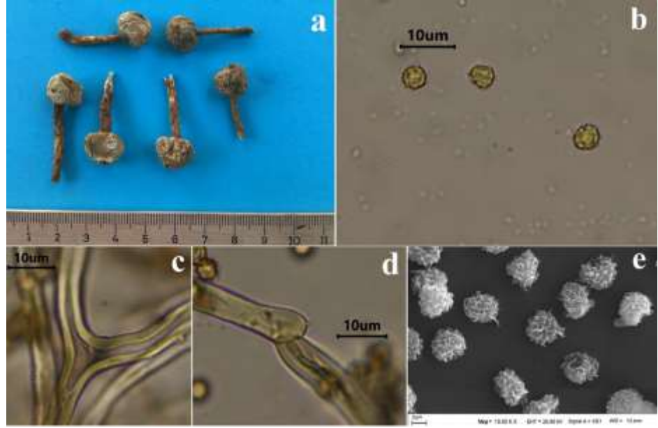
Figure 2. Tulostoma subsquamosum : a. basidiomata, b. spores (LM), c-d. capillitium (LM) e. spores (SEM). Şekil 1. Tulostoma simulans: a. bazidiyomata, b. sporlar (LM), c-d. kapilisyum (LM), e. sporlar (SEM).

As a result of the phylogenetic analysis, the specimens ANK Akata and Altuntaş 647 and ANK Akata and Altuntaş 675 were clustered with species of T. simulans and T. subsquamosum respectively. On the other side, Coprinus comatus fell into a distinct branch separate from the Tulostoma species and formed an out-group as expected. The BLAST analysis