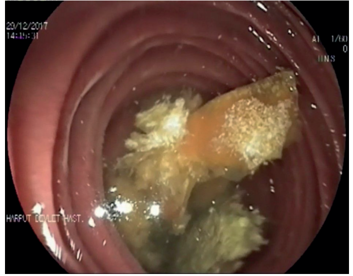
Figure 4. Endoscopic view of the bezoar case in the efferent loop of gastrojejunostomy before fragmentetion

bezoars can be preferred in most cases. (17-19) (Figure 4 and 5). However, in patients who cannot be treated with endoscopic intervention or in the presence of concomitant intestinal bezoars, as in our 2 patients, or ileus secondary to fragmentation, as in our 2 patients, surgery may be required for obstruction and complications (5, 20). Migation of the disruted bezoar fragments can lead to failure of nonoperative management options (20). Lin et al, evaluated 63 patients with gastric bezoar and they need surgical intervention only 1 of 48 patients who underwent combined chemotherapy with endoscopic intervention (17). In another case report presented by Chen et al, they observed intestinal obstruction on the 5th day after endoscopic fragmentation (20). In our study, intestinal obstruction after endoscopic intervention was seen in 2 of the patients on the 2nd and 3rd days after the procedure. Therefore, patients who have undergone endoscopic intervention should be followed closely from the hospital.