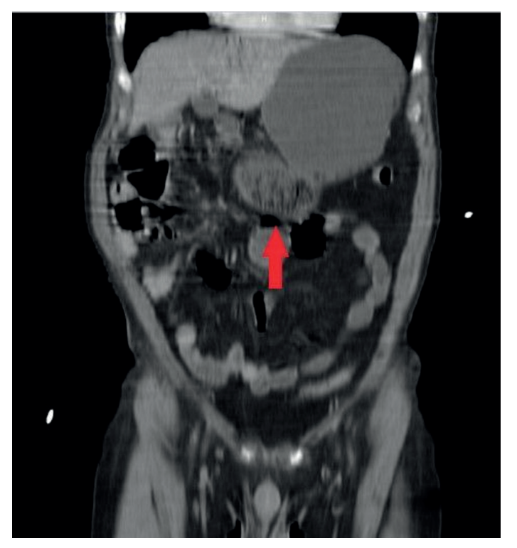
Figure 1. Coronal CT view of the bezoar case with gastric outlet (Showed with red arrow)

Especially for small bowel obstruction with additional pathology, CT examinations is the first step diagnostic method that can be applied quickly in determining the cause and level of obstruction (12,16). Regardless of the anatomical location of the bezoar (gastric or intestinal), it manifests as non-homogeneous oval lesions with in gas and soft tissue density (Figure 1 and 2). If oral contrast is given, the mass is surronded by contrast (12) (Figure 3). However, if gas is not seen in it, it may be difficult to differentiate from intussusception or intraluminal tumors (5).