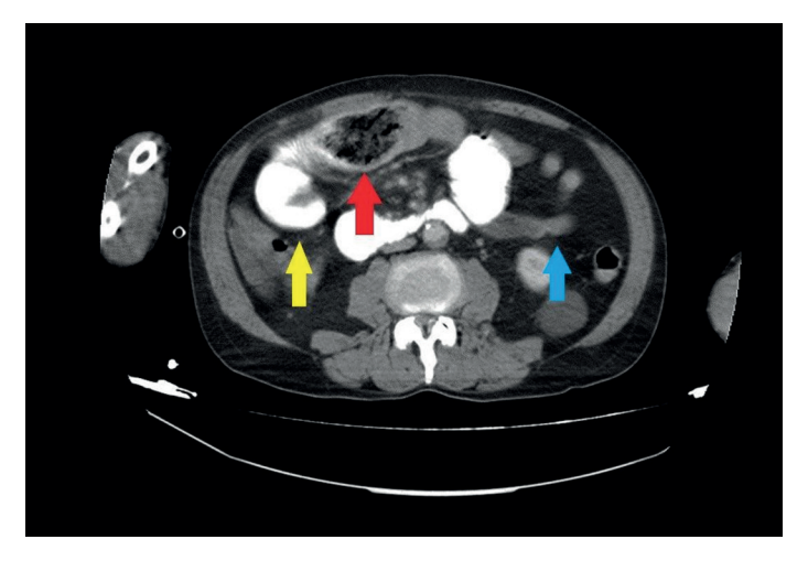
Figure 3. Horizontal CT view of the bezoar case resulted with intestinal obstruciton (Red arrow: Phytobezoar; Yellow arrow: Dilated proximal intestine; Blue arrow: Intestine after bezoar)

Yakan et al mentioned that only 7% of their operated bezoar cases due to acute small bowel obstruction. The reason for low rates of their cases is that they do not use imaging methods containing with oral contrast (5). In our study, CT with or without enhanced contrast was applied. For this reason we didn't have confusion in diagnosis preoperatively.