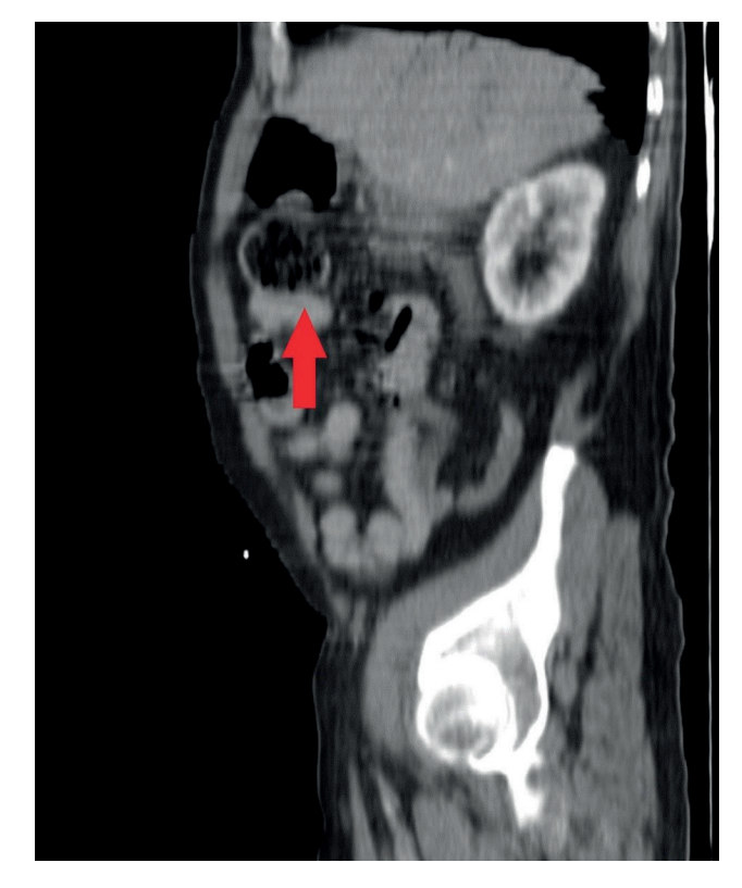
Figure 2. Sagital CT view of the bezoar case with gastric outlet (Showed with red arrow)