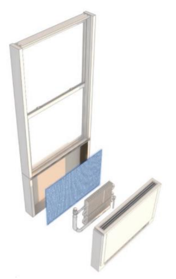
Figure 4. Reflective barriers used in windows (ESRT,2020)