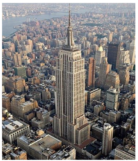
Figure 1. Empire State Building (ESB,2021)