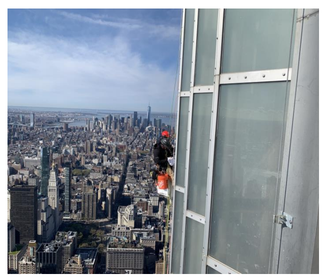
Figure 2. Maintenance work on the facade of the building (Mattani,2020)

As a result of these studies, 2020 was a productive year for the building. The building received a 76% rating from the Energy Star Certification, a Gold rating from the LEED EB O&M v4 Certification, an 83% rating from the Fitwell Certification, the Green Lease Gold leadership of 2020, and a 100% rating from the WELL Covid-19 Health Safety Rating. In addition, the Empire State Building was the first building in the country to receive the WELL Covid-19 Health Safety Rating within the scope of procedures and protocols in response to the Covid-19 pandemic (ESRT, 2020).