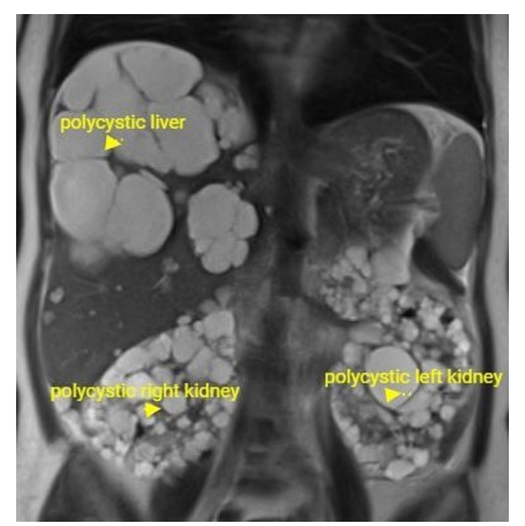
Figur 1. MRI image of ADPKD patient with PLD

formed based on GFR values—GFR \geq 60 and GFR <60 groups. Chi-square and t tests were used for performing comparisons between patients with and those without PLD. A p-value of 0.05 was considered statistically significant all of the aforementioned tests which were designed as two-sided.